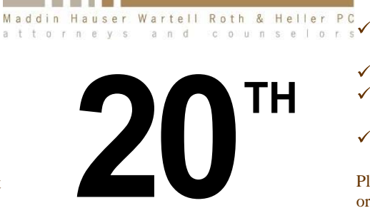
Annual Tax Symposium

Maddin Hauser lawyers will present current topics of interest, including: